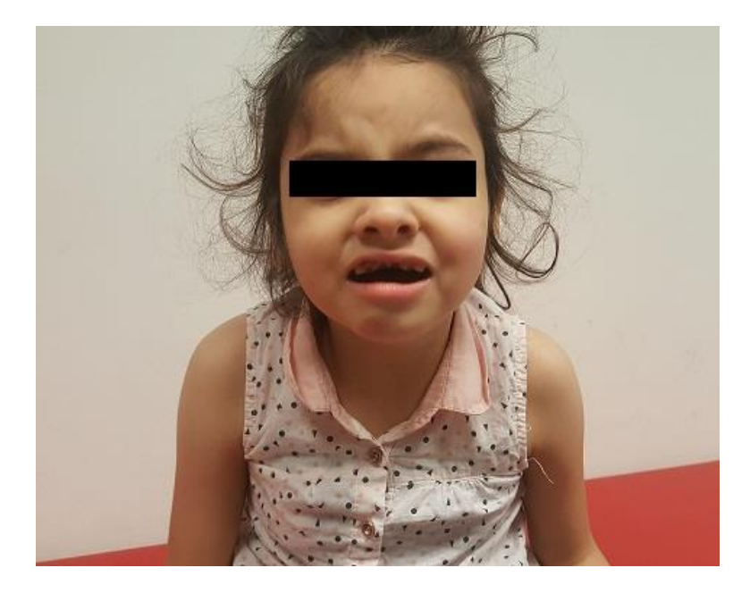
Figure 2: The case.