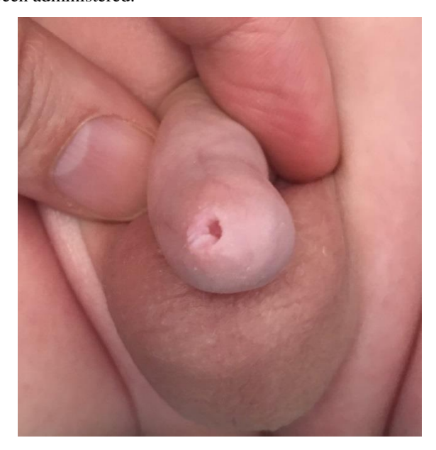
Figure 1: Physiologic Phimosis: distal part of the prepuce is healthy without fibrosis

The families of the patients with PhP have been informed about phimosis and smegma. No additional treatments have been administered.