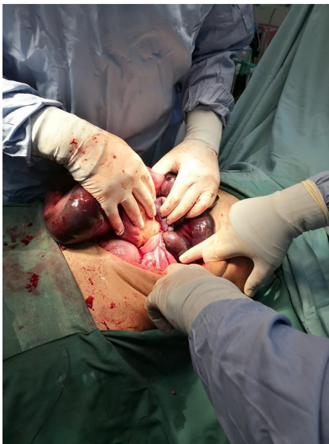
Figure 2: Intra operative picture showing the Ileosigmoid knot

The entire gangrenous segment is twisted around its mesentery surrounding a dilated gangrenous sigmoid volvulus. Abdominal cavity had full of serosanguinous fluid.